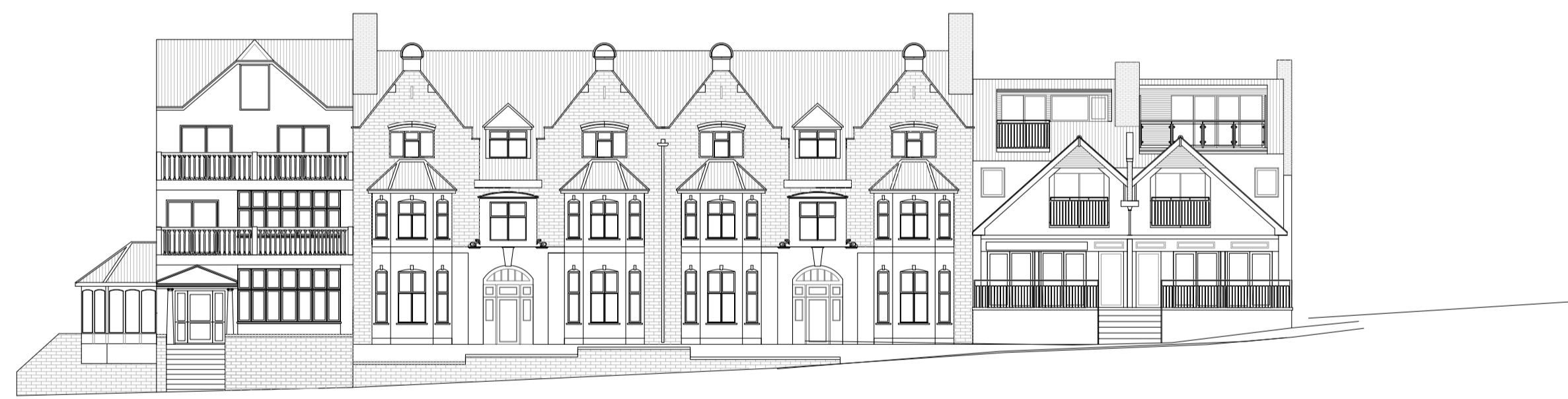
Existing Street scene - 1:200