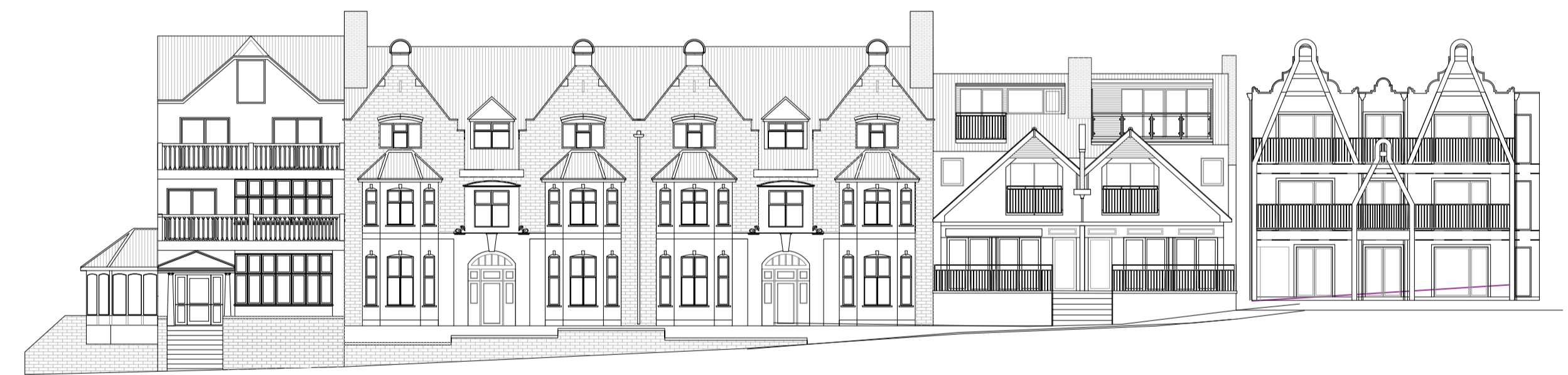
Proposed Street scene - 1:200