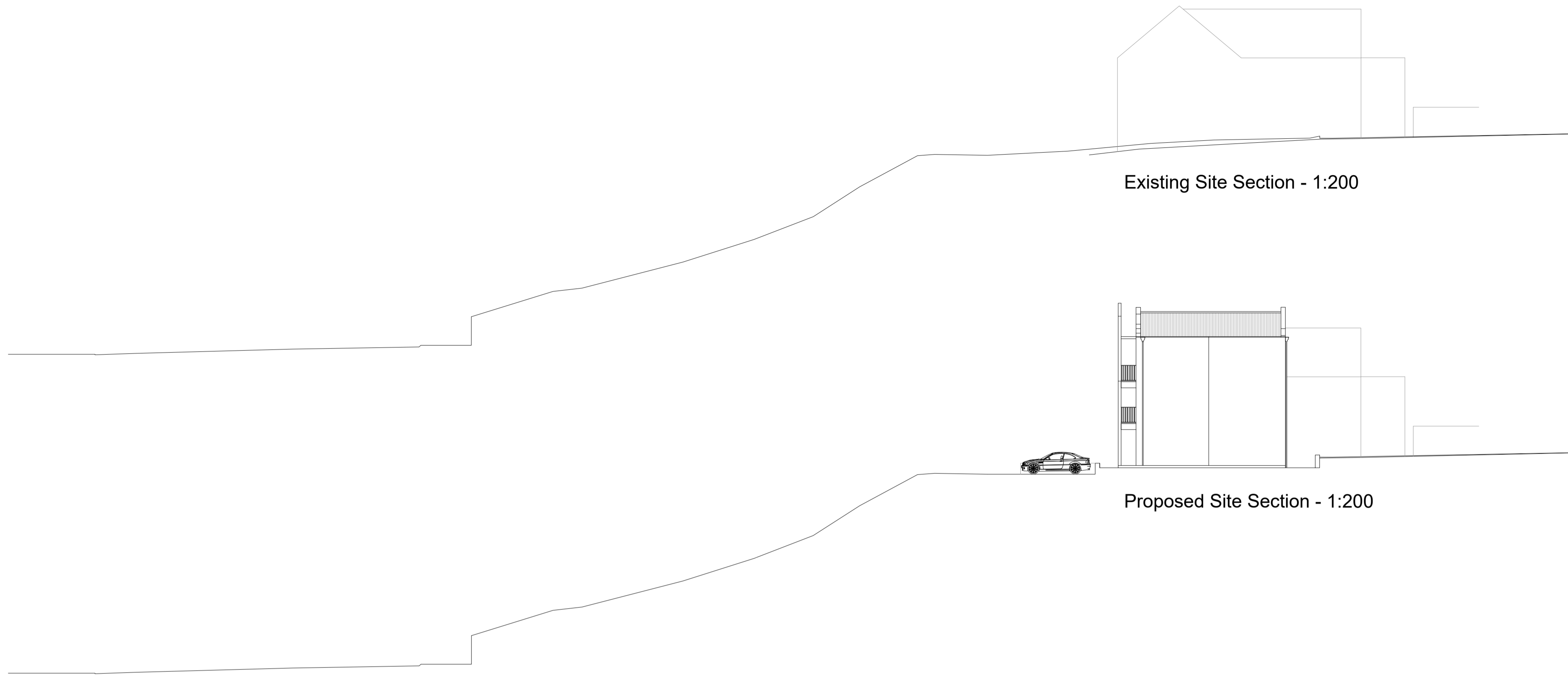
Existing Site Section - 1:200