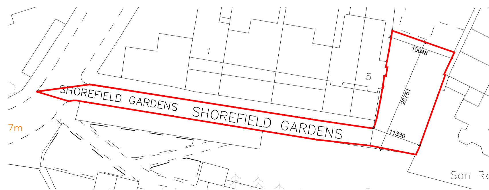
Existing Block Plan - 1:500 North